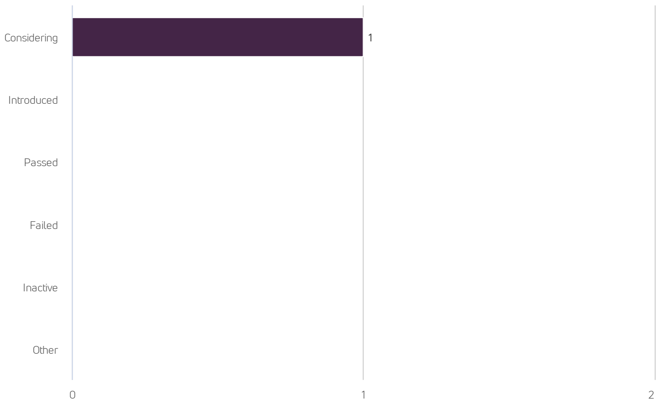
■ Bills by Status