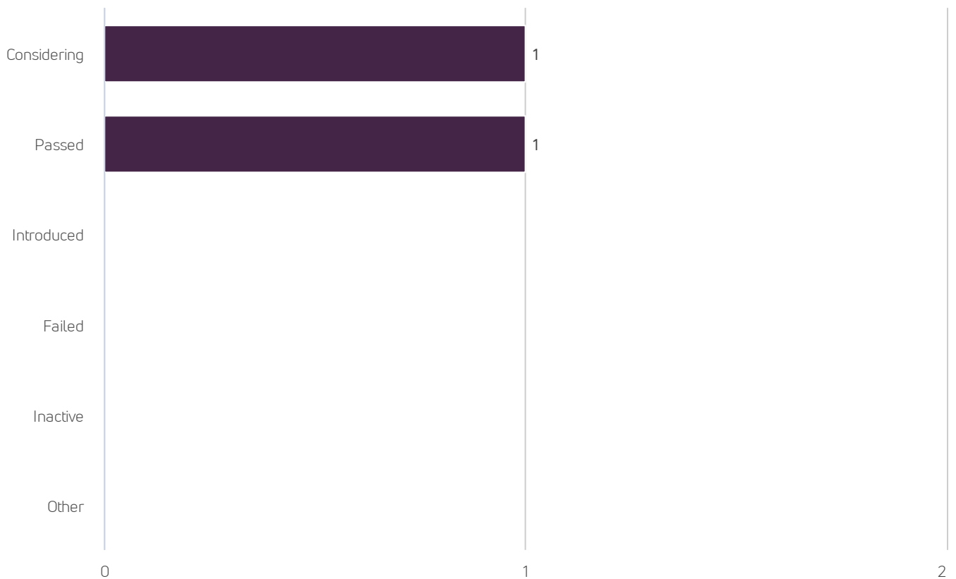
■ Bills by Status