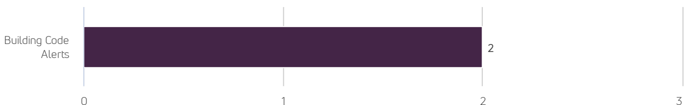
■ Bills per issue