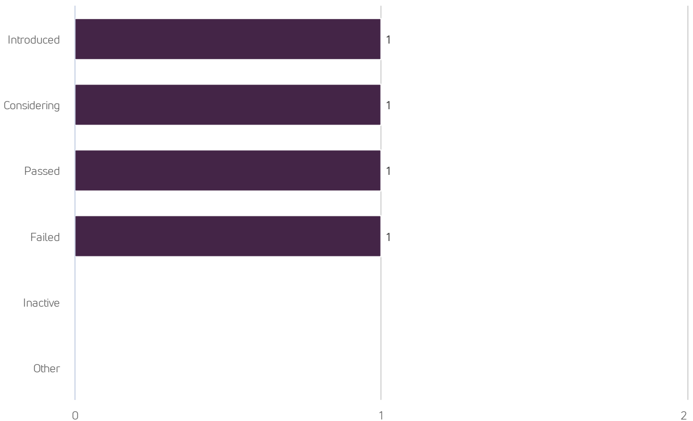
■ Bills by Status